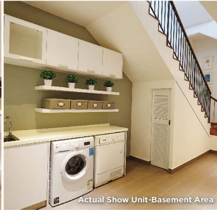
Actual Show Unit-Basement Area