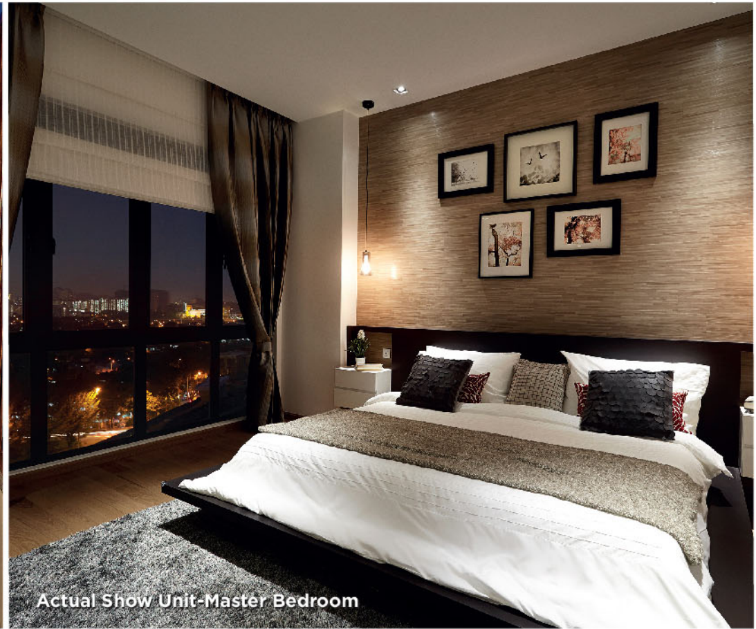
Actual Show Unit-Master Bedroom