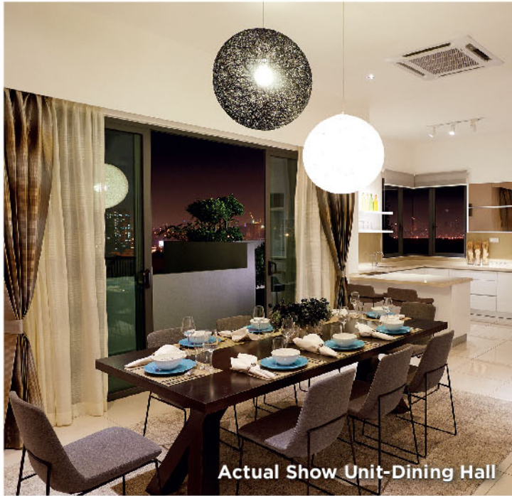
Actual Show Unit-Dining Hall