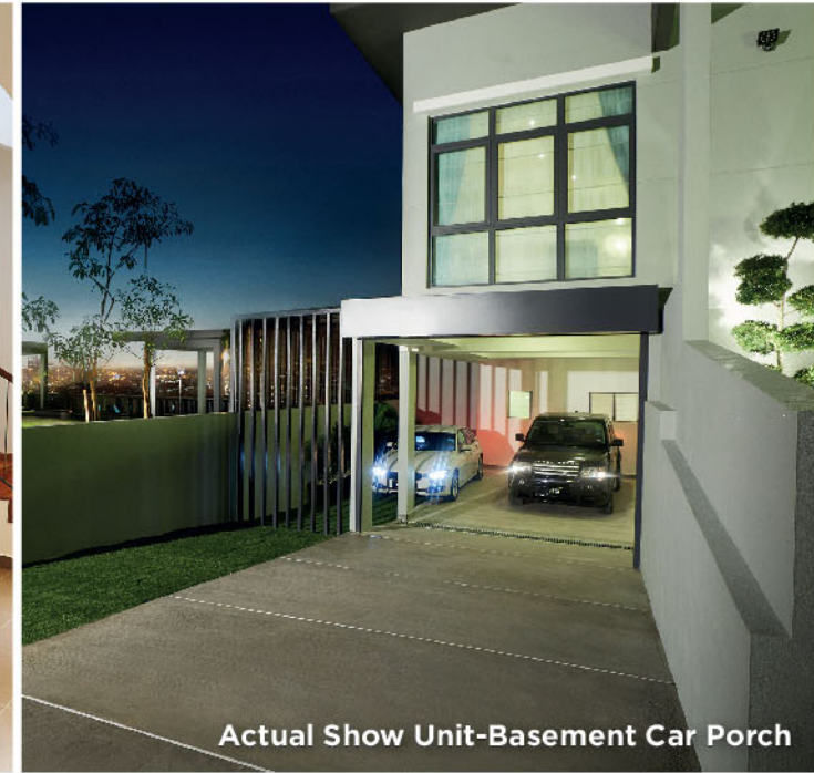
Actual Show Unit-Basement Car Porch

Guarded Community, single entrance with guardhouse | Easy Access to Major Highways (12KM from city centre) | Built-up from 4,092 square feet Basement Car Park | High Ceiling - 4 metres at Ground Floor | Private Home Lift | Flat Roof with Panoramic KL Cityscapes 4 En Suite Bedrooms | Rainwater Harvesting System