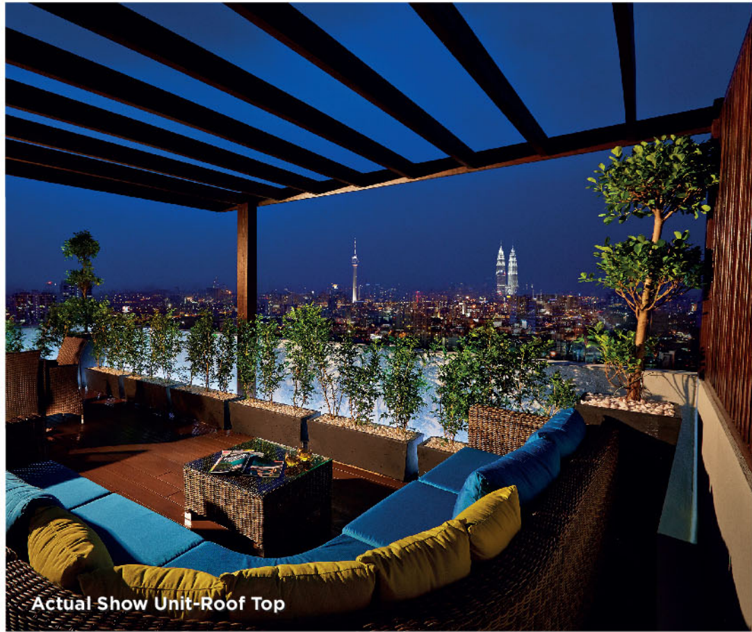
Actual Show Unit-Roof Top