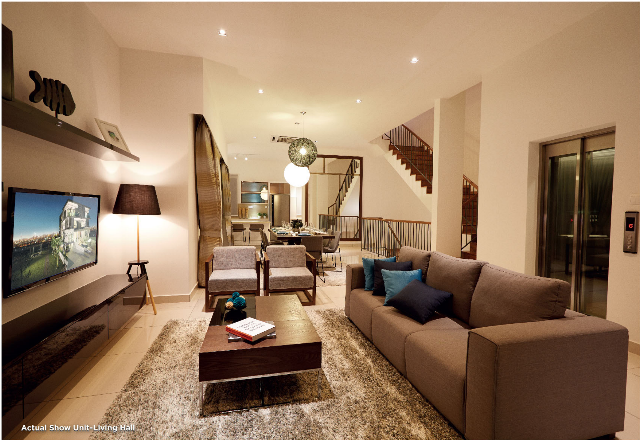
Actual Show Unit-Living Hall